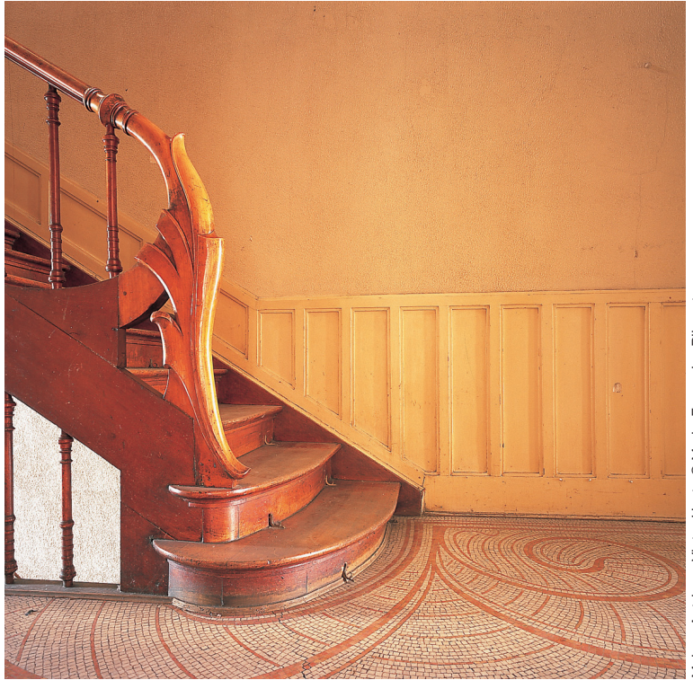
Maison Aurtrique, Victor Horta