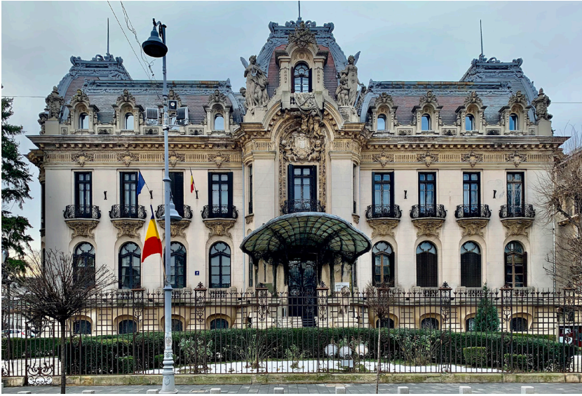
Cantacuzino Palace / The Museum George Enescu, Bucharest, Romania