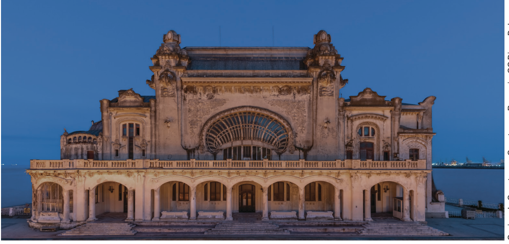
Casino de Constanța, Constanța, Romania