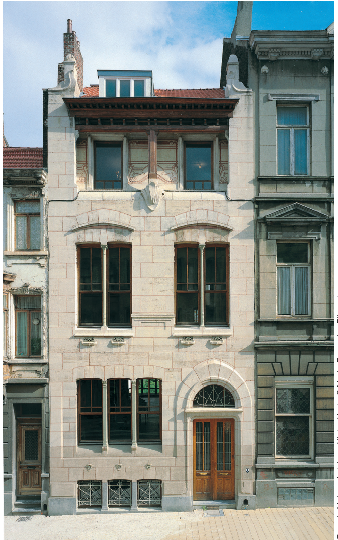
Façade Maison Autrique, Victor Horta