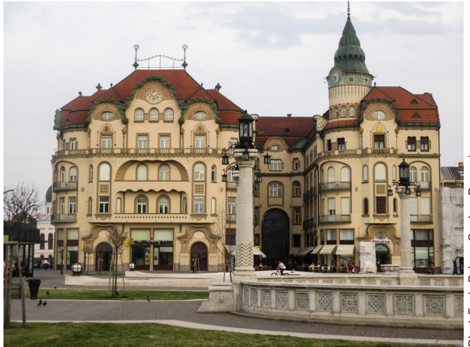
Black Eagle Palace, Oradea, Romania